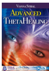
'Advanced ThetaHealing™' book.