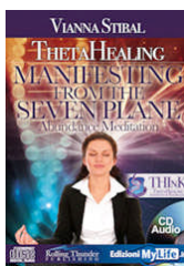
ThetaHealing™ 'Manifesting and Abundance' CD.